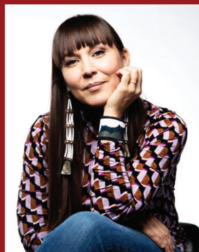
PORTRAIT BY CARA ROMERO