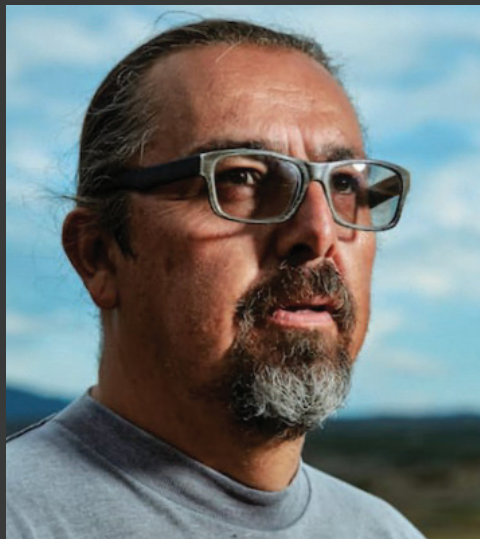
PORTRAIT BY NATE ABBOTT

NATIVE FADED , 2019 CHARRED PAPER, 24 X 18 INCHES