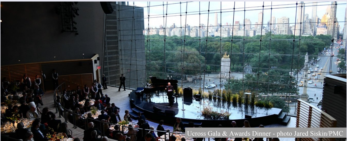
Ucross Gala & Awards Dinner